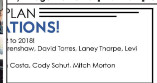
1/2 Page Elementary Ad Example