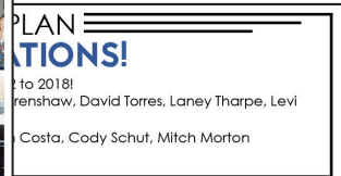
1/2 Page Elementary Ad Example